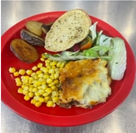
Lasagne, Garlic Bread, Sweetcorn & New Potatoes

School dinners are getting more and more popular and we are now providing over 650 meals per week to our pupils. With our fantastic new menu we are hoping to encourage more of our pupils to eat a hot lunch every day. Here are some of the pupils favourite meals. We also provide a salad cart with lots of healthy choices that pupils can add to their meal.