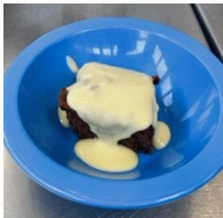
Chocolate Cake & Custard