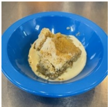
Apple Crumble & Cream