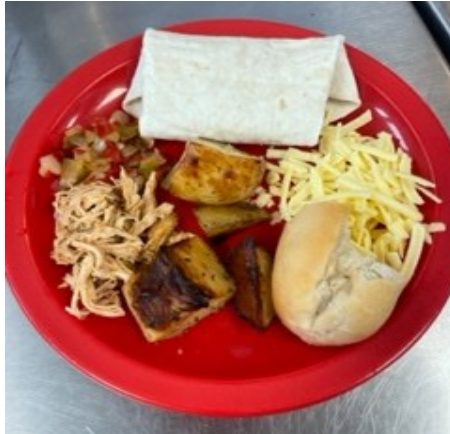
Chicken or Veggie Fajitas & Potato Wedges,