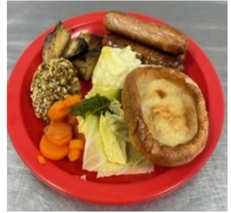
Chicken or Veggie Sausages/Quorn Sausages, Roast Potatoes, Yorkshire Pudding, Carrots Cabbage & Cauliflower Cheese, Stuffing & Gravy