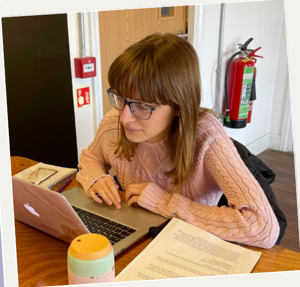
Intern working at Sun Pier House