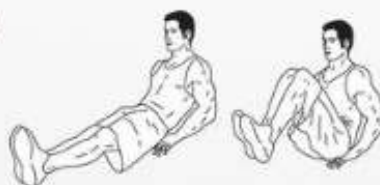
9. knee pull-ins