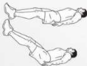
8. leg raises