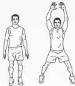
2. jumping jacks