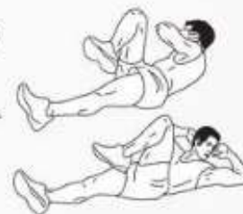
7. bicycle crunches