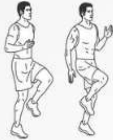
1. high knees