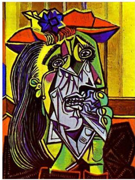
Pablo Picasso Weeping woman 1937