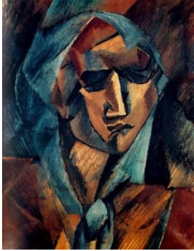
Georges Braque 'Head of a Woman' 1909

This way of working became known as CUBISM