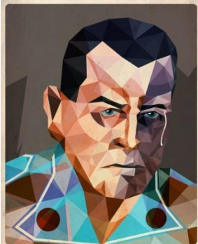
Illustration by Dave Murray

In the space below describe what parts of PICASSO and BRAQUE'S work could have inspired the work of the Illustrator DAVE MURRAY shown underneath